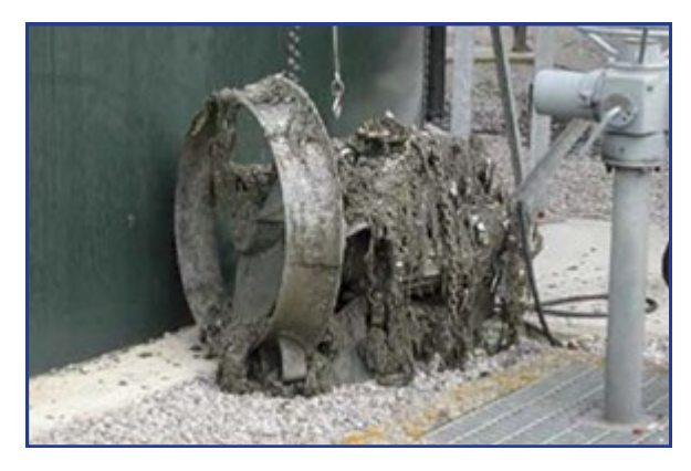
Typical ragged up submersible mixer, which has to be lifted out of the tank for cleaning